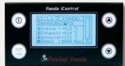
Panda iControl Panel