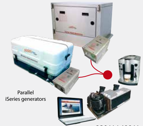
Parallel iSeries generators